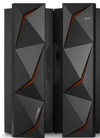
Exhibit 1 — LinuxONE Emperor II

When IBM announced the LinuxONE in 2015 2 , some observers might have considered it as a long shot, a move of desperation. After all, there was no differentiation in the hardware, and a number of all-IFL systems previously had been sold and installed successfully. But by placing boundaries on the configurability, without compromising any of the qualities of service typical of IBM mainframes,